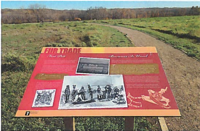
Fort Pitt Provincial Park.