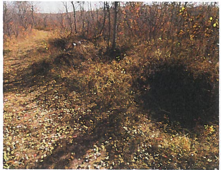
Cree rifle pits, Frenchman Butte National Historic Site.

Return to Grid 797 and continue 22 km east to the hamlet of Frenchman Butte, beautifully situated on the bank of the North Saskatchewan River. Be sure to visit the impressive Frenchman Butte Museum, a complex of nine buildings plus a teahouse and RV park. A few 1885 artifacts include firearms used by the militia and Steele's scouts, an original Hudson's Bay Company trade musket, photographs of Fort Pitt from 1884, a buckskin jacket worn by Métis leader Louis Riel and a diary of the events written by the Indian Agent in nearby Onion Lake. With advance notice, the museum can also arrange for guided tours of area historic sites.